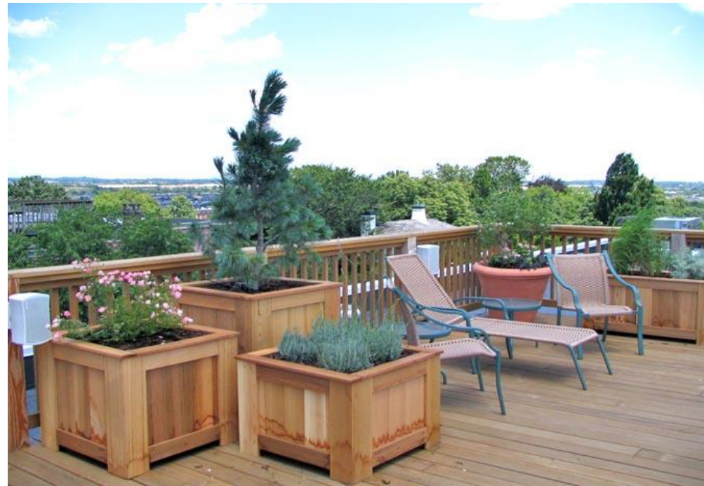
Plants grown in box