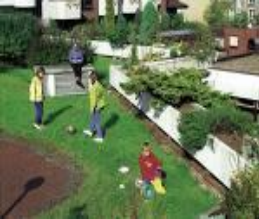
Lawn in Roof Garden