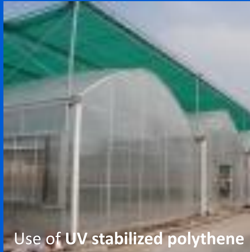
Use of UV stabilized polythene