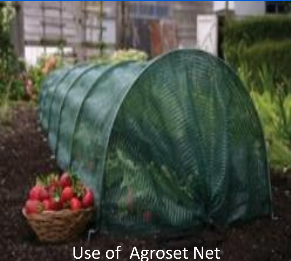
Use of Agroset Net